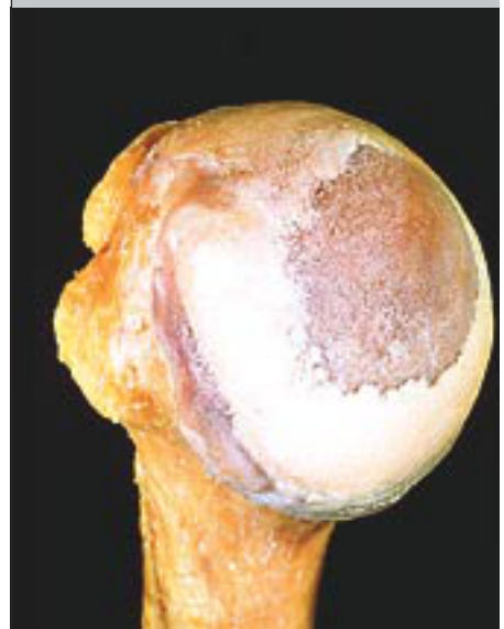
osteoarthritis humeral head