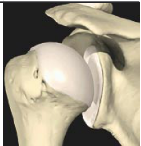
humeral head and glenoid left shoulder (rear view)

After an initial stay of 4 to 5 days in the hospital the patients are transferred to a rehabilitation center where they are treated as in-patients during 3 to 4 weeks. After this period of time physiotherapy is continued on an out-patient basis by specialized therapists. During the early postoperative phase the patients should wear a soft shoulder support which gives some protection against pain and mechanical stress. The after-treatment is always functional and begins at the first day after the intervention. The exercises for increased joint mobility will be intensified after 2 weeks, ideally as aquatherapy. Beside the specific physiotherapy, exercises for muscular reinforcement are started very early. All the patients are seen by their surgeon regularly. The whole team is devoted to a closed team work between surgeon, therapist and patient, which is mandatory for the best possible outcome of joint mobility, muscular strength and pain relief. (see pictures)