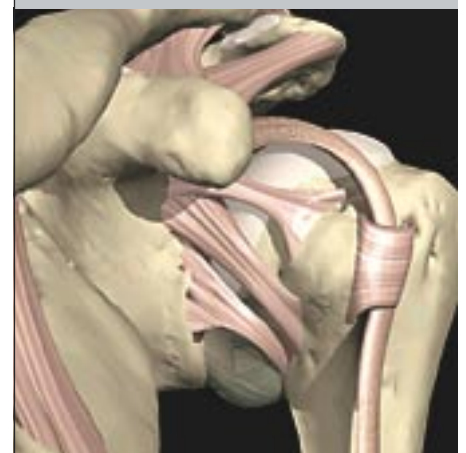
Ligamentous structures and long head of biceps tendon - left shoulder (front view)