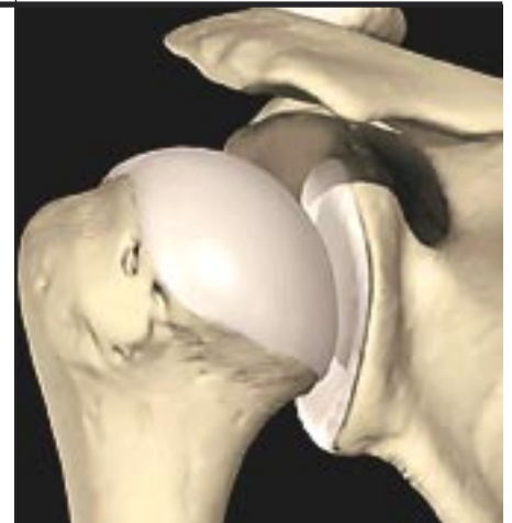
humeral head and glenoid left shoulder (rear view)

tendons, bony appositions at the acromion, osteoarthritis of the articular connection between clavicle and acromion (acromioclavicular joint) or calcified deposits in the rotator cuff often are causing a painful inflammation of the subacromial bursa. The patient's history, a thorough clinical examination and x-rays as well as ultrasound and/or MRI will lead to a precise diagnosis.